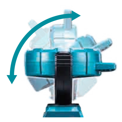
Up 90°, Down 45°, Left / Right 90°