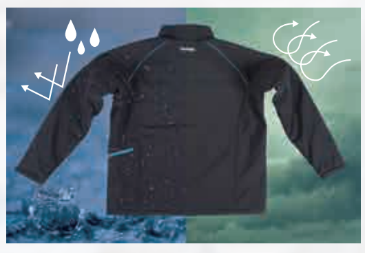
Fleece lining warms a body even when switch is off

prevents penetration of water such as light rain.