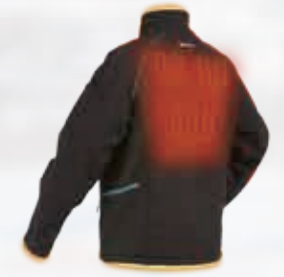
4 Heat zones DCV202/CV102D

Left chest, right chest and back, neck have each heating element.