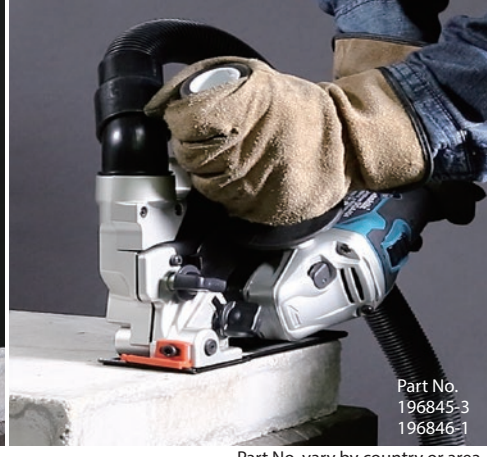
Part No. vary by country or area