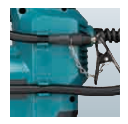
Storing hose The hose can be attached to the hose holder of the tool.