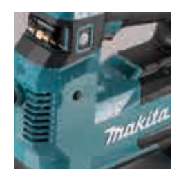
eXtreme Protection Technology