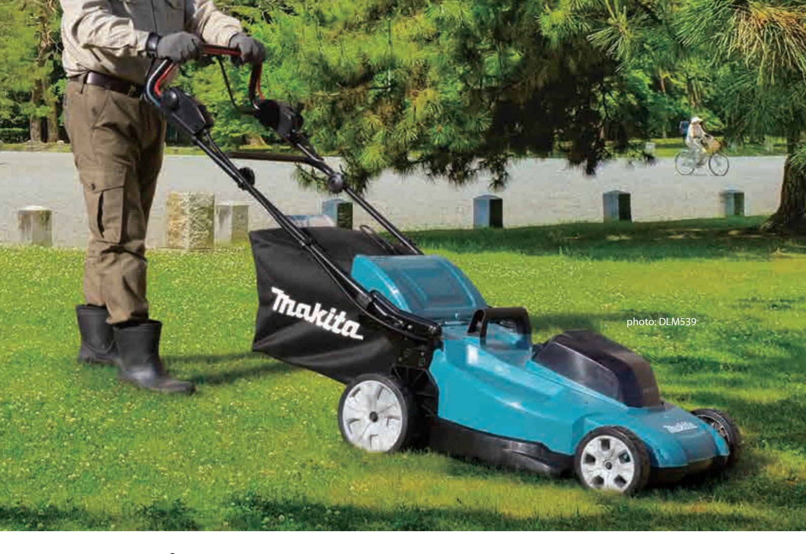
4 in 1 (Cutting/ Collecting/ Mulching/ Rear discharge)